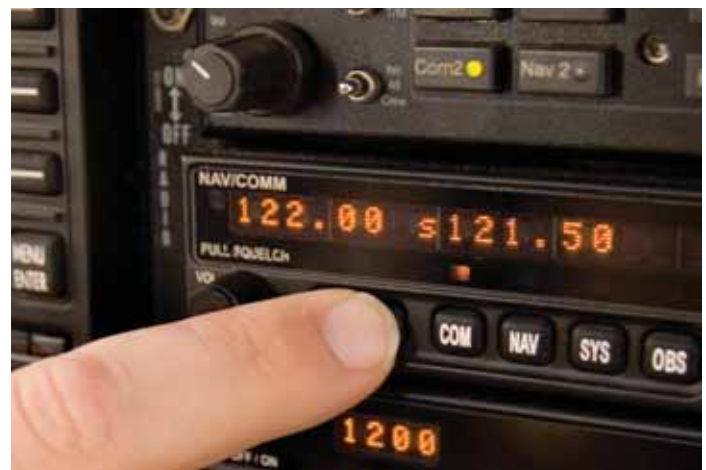
In a critical situation, help is as close as your radio.

Suppose that, despite good intentions, everything goes wrong and you're faced with a critical decision. The absolute, number one priority should be getting on the ground alive and unharmed . In some cases, that might mean making a precautionary off-airport landing, even if it involves damaging or destroying the aircraft. That's why we have aircraft insurance. Airplanes can be replaced—people cannot.