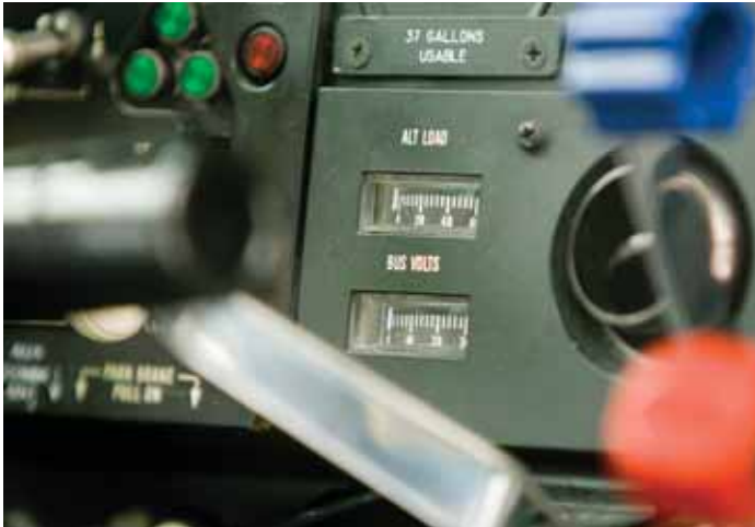
Some problems are easy to overlook.

Some problems are obvious. A broken crankshaft will make itself known immediately. But smaller, more insidious problems can be difficult to detect if you're not paying close attention. Deviations from the weather forecast can be quite subtle. Trouble with the aircraft—a failing electrical system, for example—can easily be overlooked.